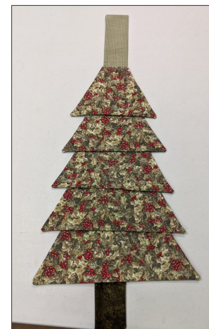
Christmas tree themed door hanging a participant showed during meetings.